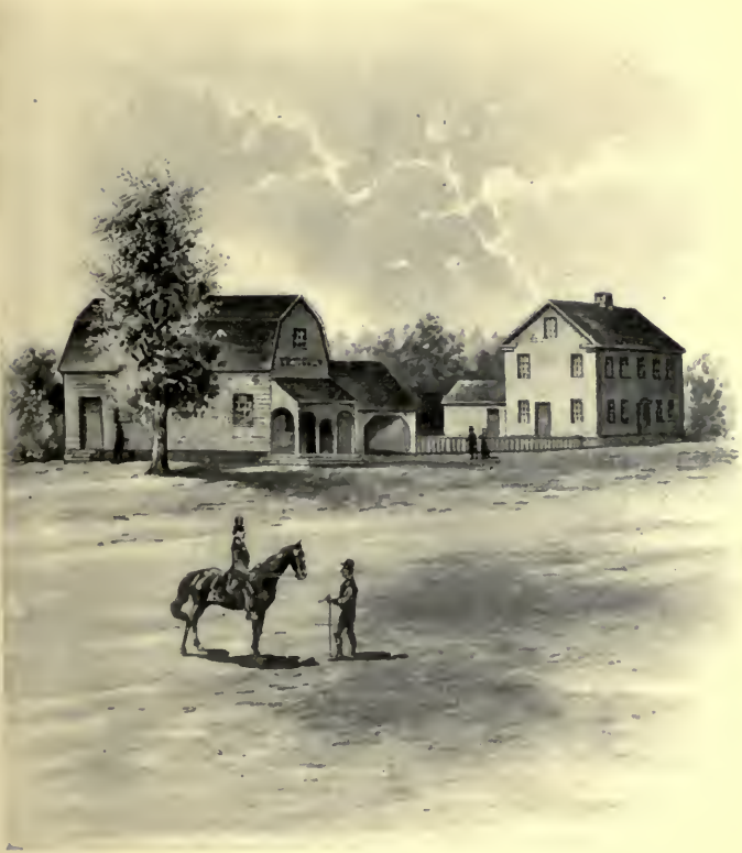
“Brother Jonathan’s” war office and residence in Lebanon, Connecticut.